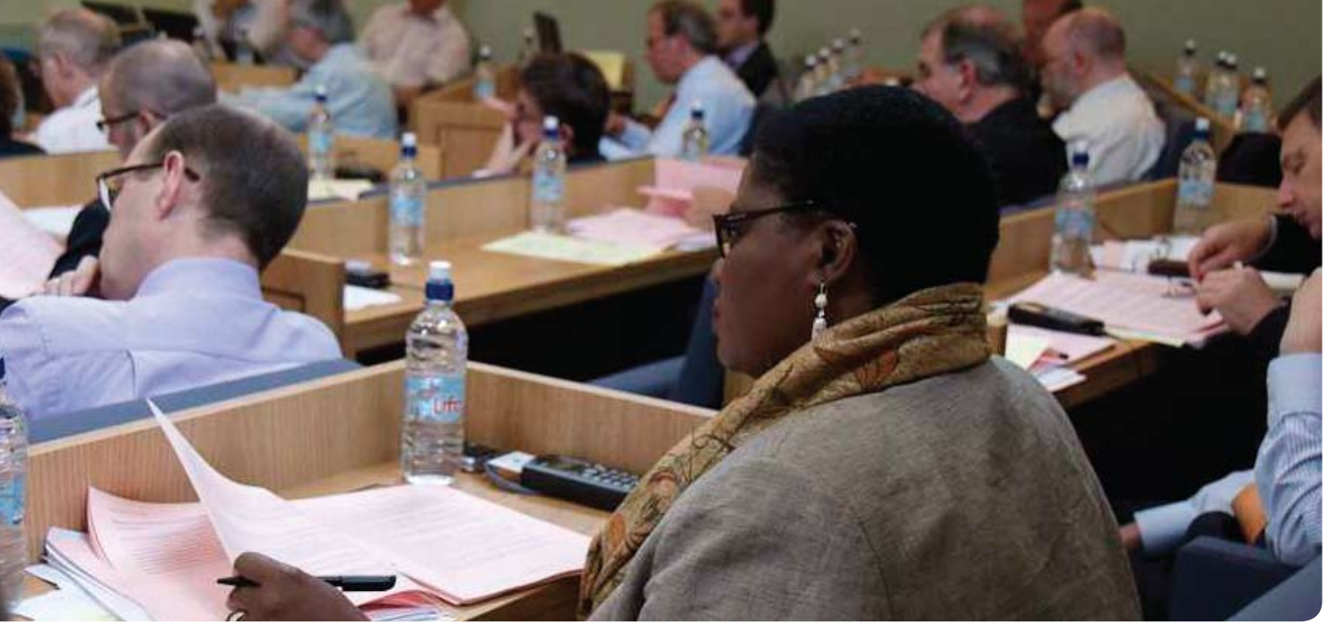
The Law Society Council in session